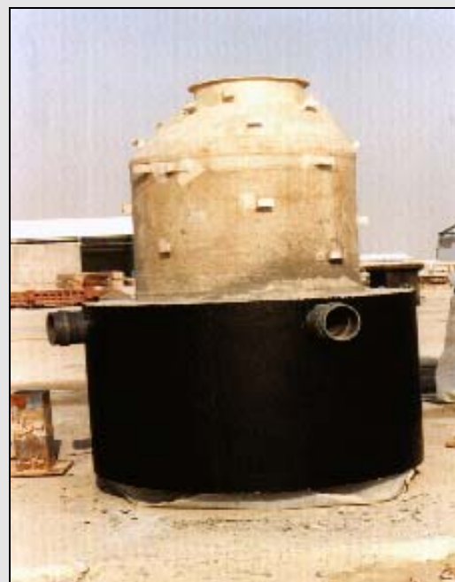
GRP Collection Sump with concrete anti-floatation collar