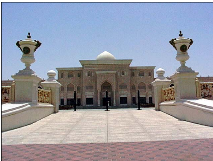
University of Sharjah

A tall order, delivered on time with the versatility of Iseki personnel and technology.