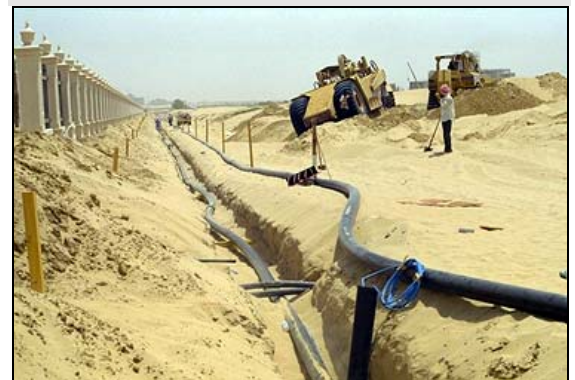
Pipe laying in progress