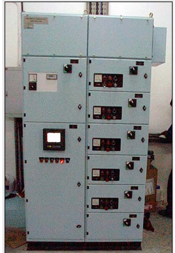
Electrical Control Panel situated in Vacuum Station